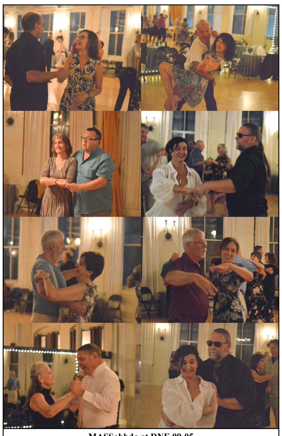
MASSabbda at DNE 09-05