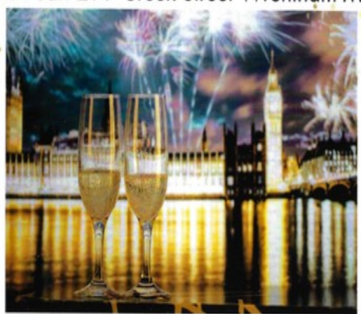
Tuesday, December 31, 2024

Continuous dancing from 7pm-12:30am in this beautiful 15:000 square foot ballroom. We will be transforming this ballroom into a beyond magical evening! Come join us as we ring in 2025 in style! Outstanding music! Couples and Singles Welcome! Hors d'oeuvre's! Buffet Dinner! Champagne Toast! Noise Makers!