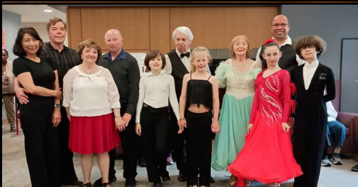
Newbridge on the Charles May 5