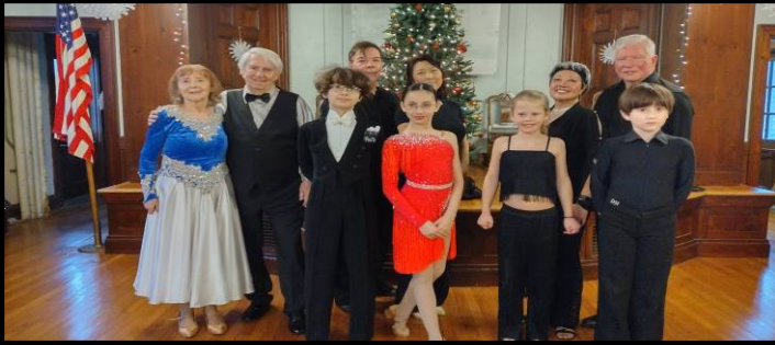
German Centre Jan 14