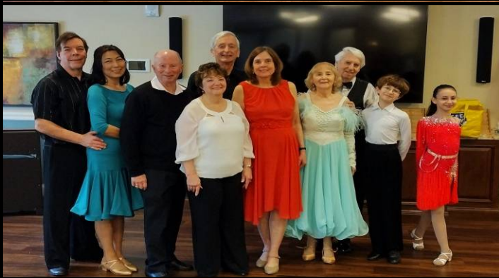
Brightview Canton Feb 26