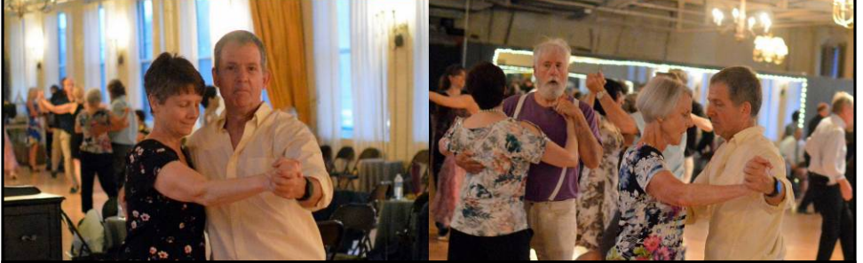
MASSabda at DNE 06-06-2024