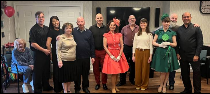
Brightview Billerica Feb 11