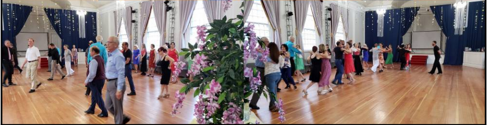
MASSabda at ARKO 06-20-2024