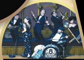
EIGHT TO THE BAR

A six-person group of consummate musicians and vocalists who can play everything including ballroom, jazz, swing, the blues, and even country and pop.