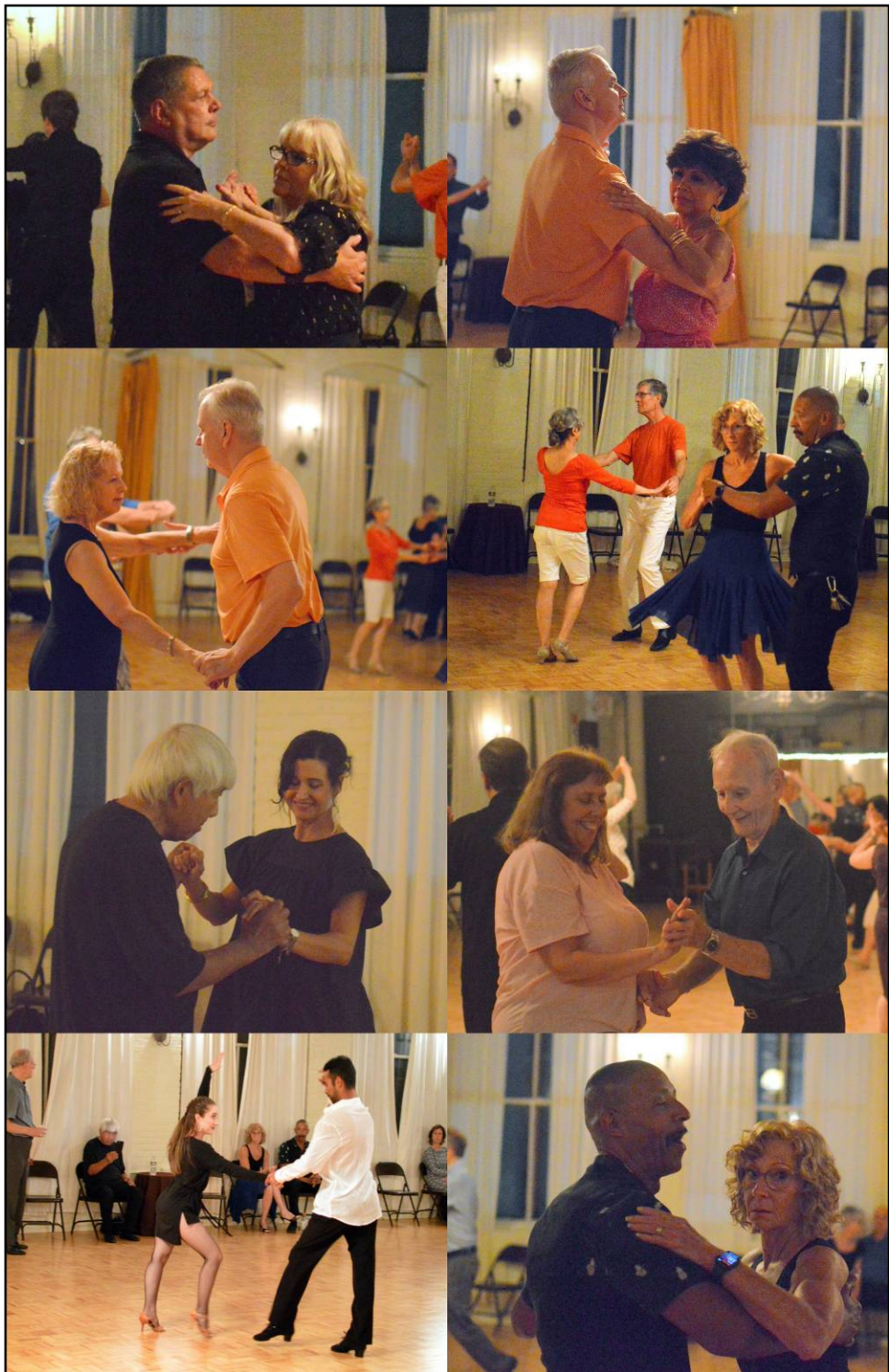
MASSabda at DNE 09-07-2023