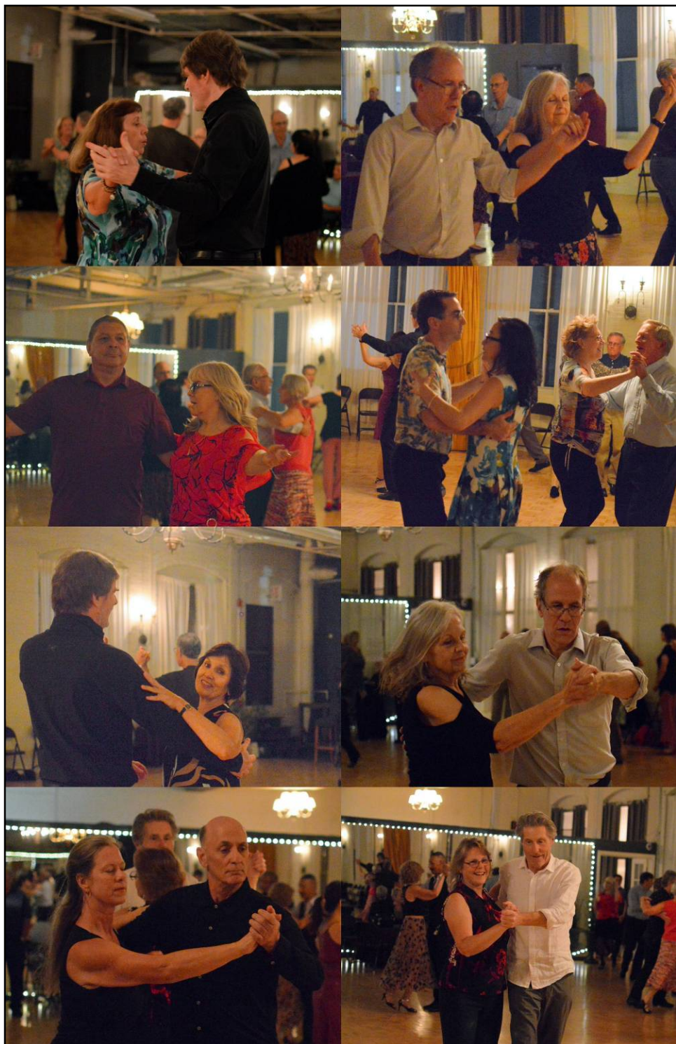
MASSabda at DNE 10-05-2023