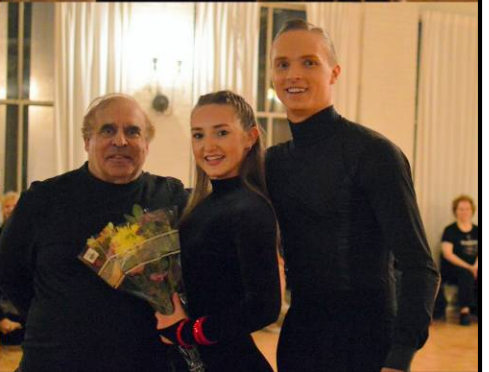
MASSabda at DNE 01/05/2023