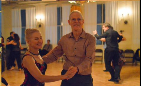
MASSabda at DNE 02/02/2023