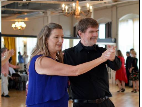
Massabda at DNE National Ballroom Week 09/25/2022