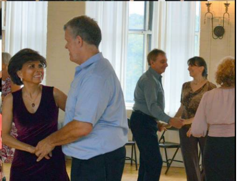
Massabda at DNE National Ballroom Week 09/25/2022