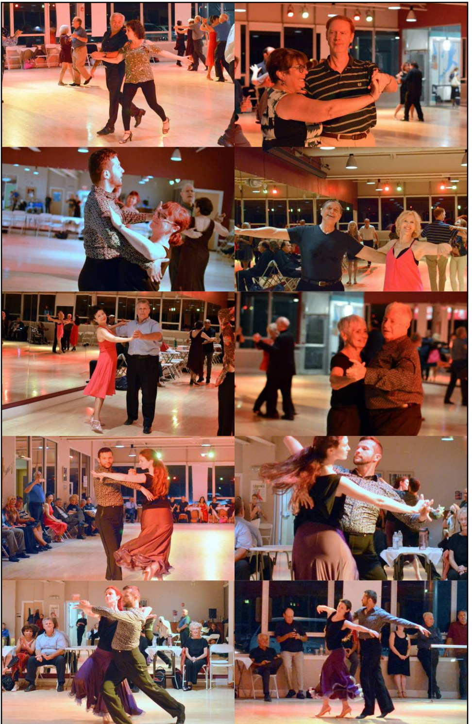
Massabda at Todos 09/17/2022