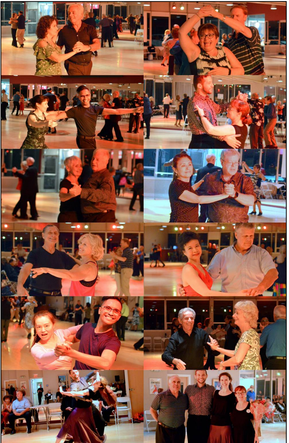
Massabda at Todos 09/17/2022