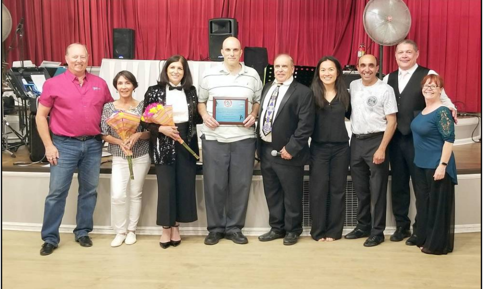
Last Massabda Dance at Moseley's 07/08/2022