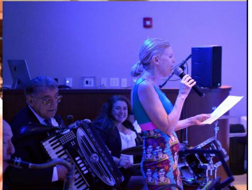
Massabda at Todos 08/03/2022