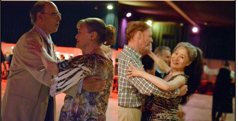
MASSabda at Moseley's 05-04-2022