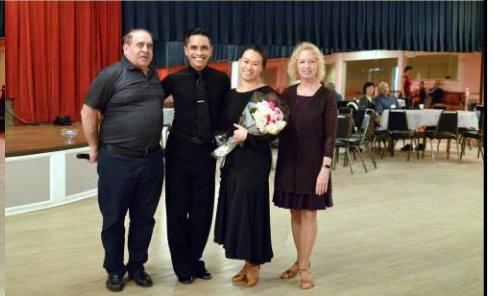
MASSabda at Moseley's 03-02-2022