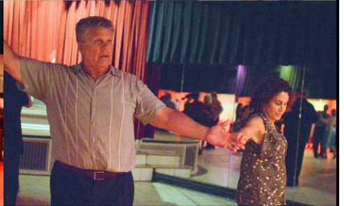
MASSabda at Moseley's 08-04-2021