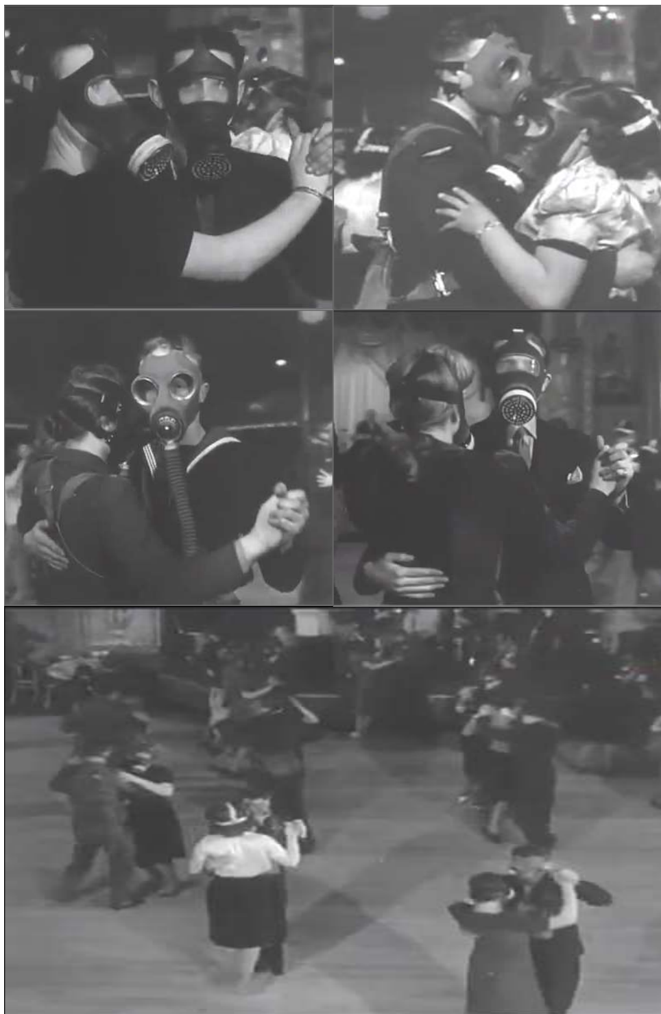
They danced anyway in England during WWII