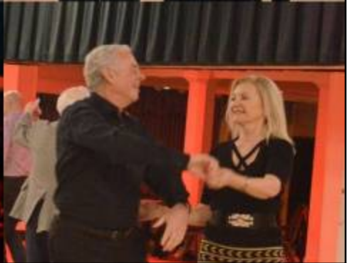
MASSabda at Moseley's 03-11-2020