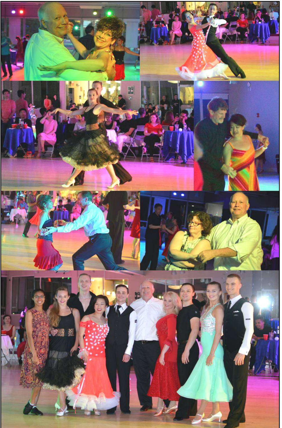
MASSabda at Todos Dance & Fitness 06-15-2019