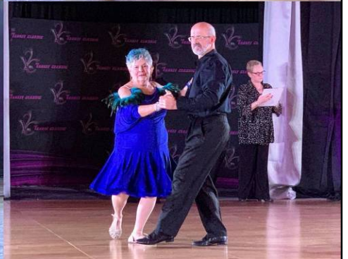
Bill Morganti Dancesport Series at The Yankee Classic 06-13-2019