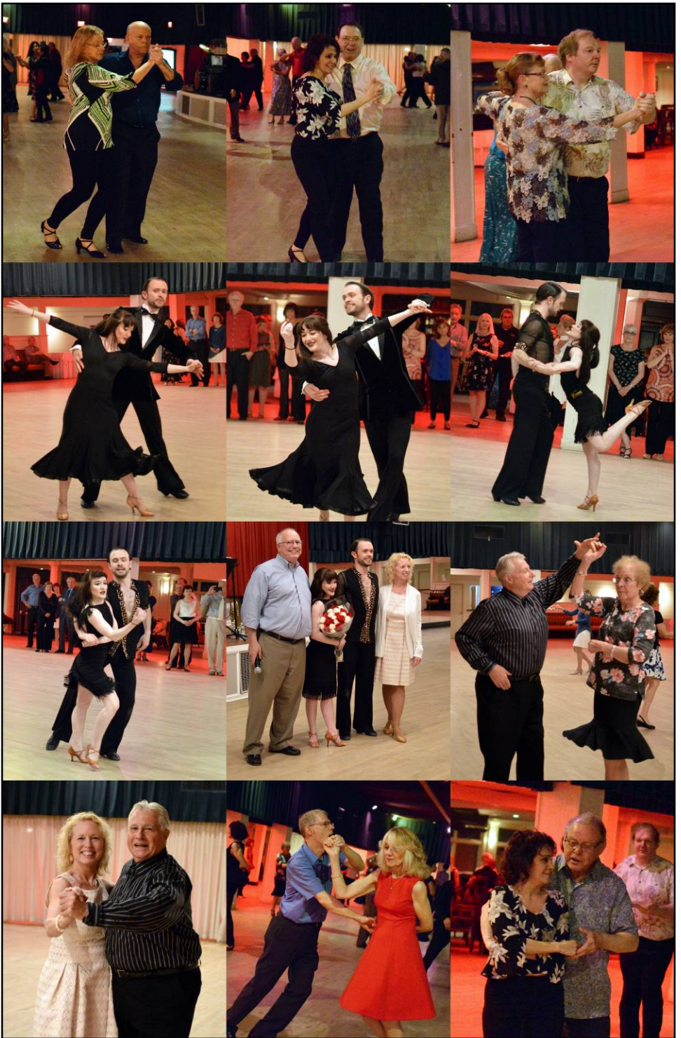
MASSabda at Moseley's 05-08-2019