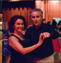
MASSabda at Moseley's 06-12-2019